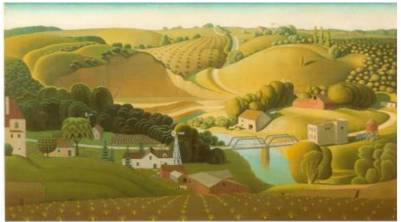
Stone City, Iowa, 1890 ©2010 wood panel, 30" x 40"