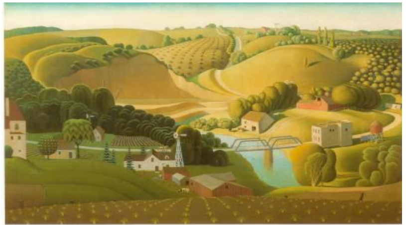
Stone City, Iowa, 1890 ©2011 wood panel, 30" x 40"