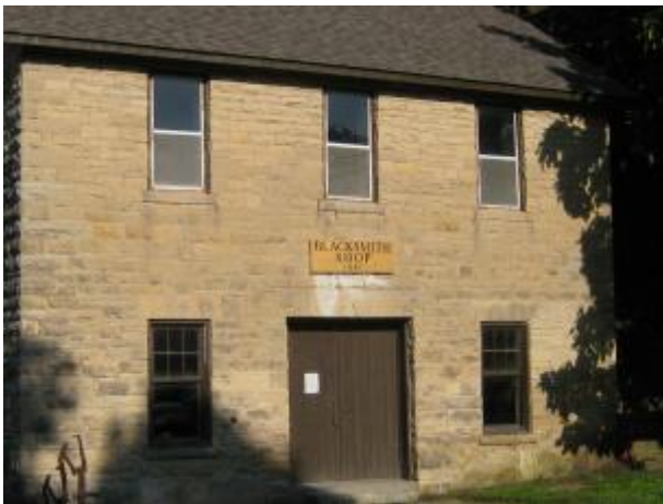
The Stone City Blacksmith shop

The Stone City Foundation board meetings are held the third Tuesday of the odd months at the Blacksmith Shop. (Jan. –Mar. – May – July – Sept. – Nov.) We will also have several social meetings; these will be announced well in advance and Everyone in the area is welcome to come to any of these meetings. We encourage you to attend and see what we have planned next. Any questions? Just call anyone of the above officers for more information.