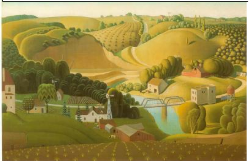
Stone City, Iowa, 1930 Grant Wood, 1891-1942