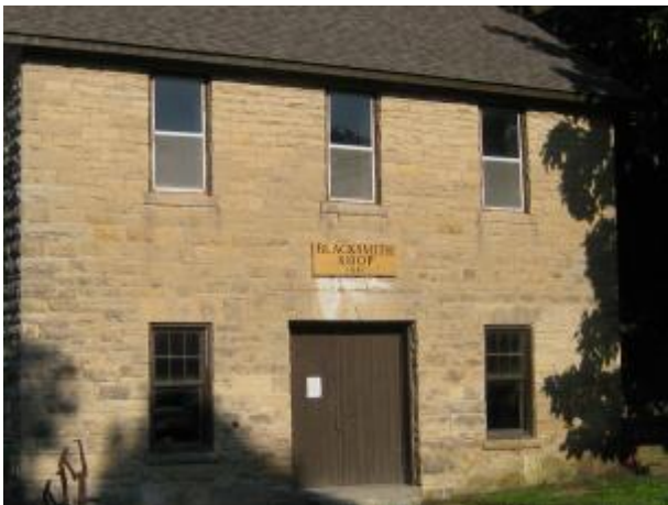
The Stone City Blacksmith shop

The General Store and Pub will be having it's second anniversary the first part of June. You will want to be on the look out for their announcement. They have had great crowds and good times, only goes to show what great service and excellent food can do.